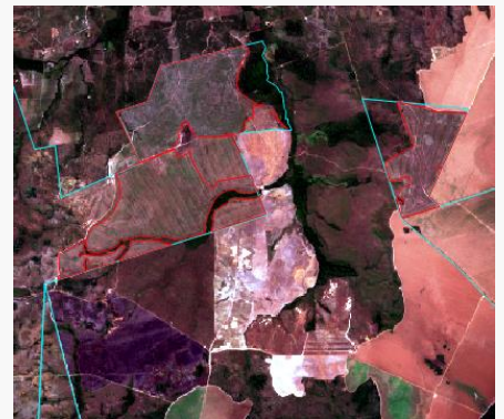
Processed image.