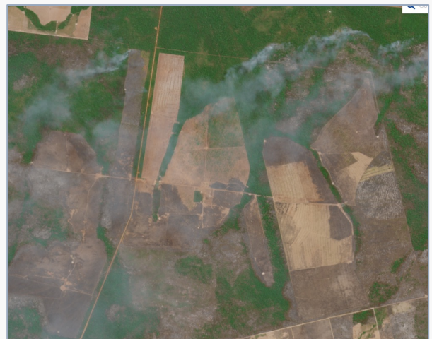
Imagery: An area of approx. 1,684 ha were cleared by fire in September 2024. The photo shows active fire on September 1st, 2024. Man-made, controlled fires are often used for the preparation of the land after deforestation.